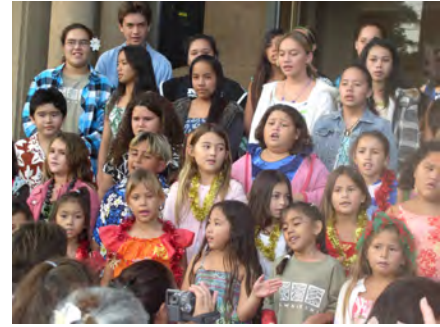
Performing at Kaua’i Museum