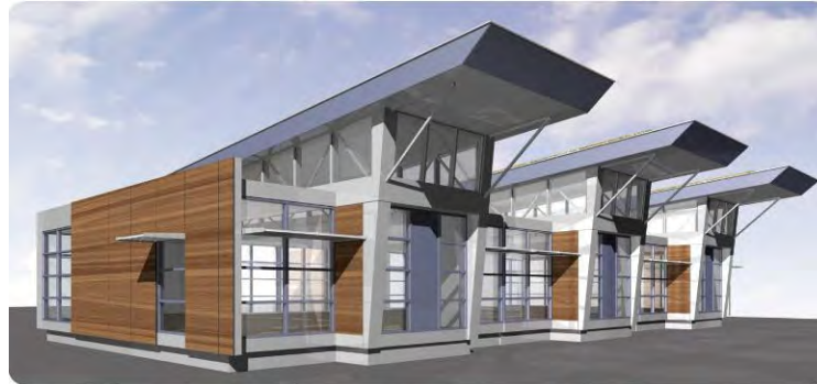
Two Project Frog Classrooms will be installed at Kawaikini

generation. These energy-neutral smart buildings will be located on the upper campus and will house Kawaikini’s secondary program. 4