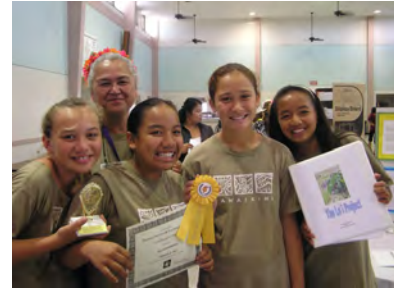
Kawaikini students won awards at Science Fair activities