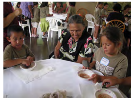
Haumana visit ALU LIKE kupuna and learn to make pa'akai.