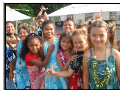
Students having fun at the first end-of-year Ho'ike'ike