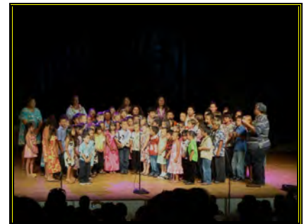
Students competing at the Eō, E Lili’u song competition