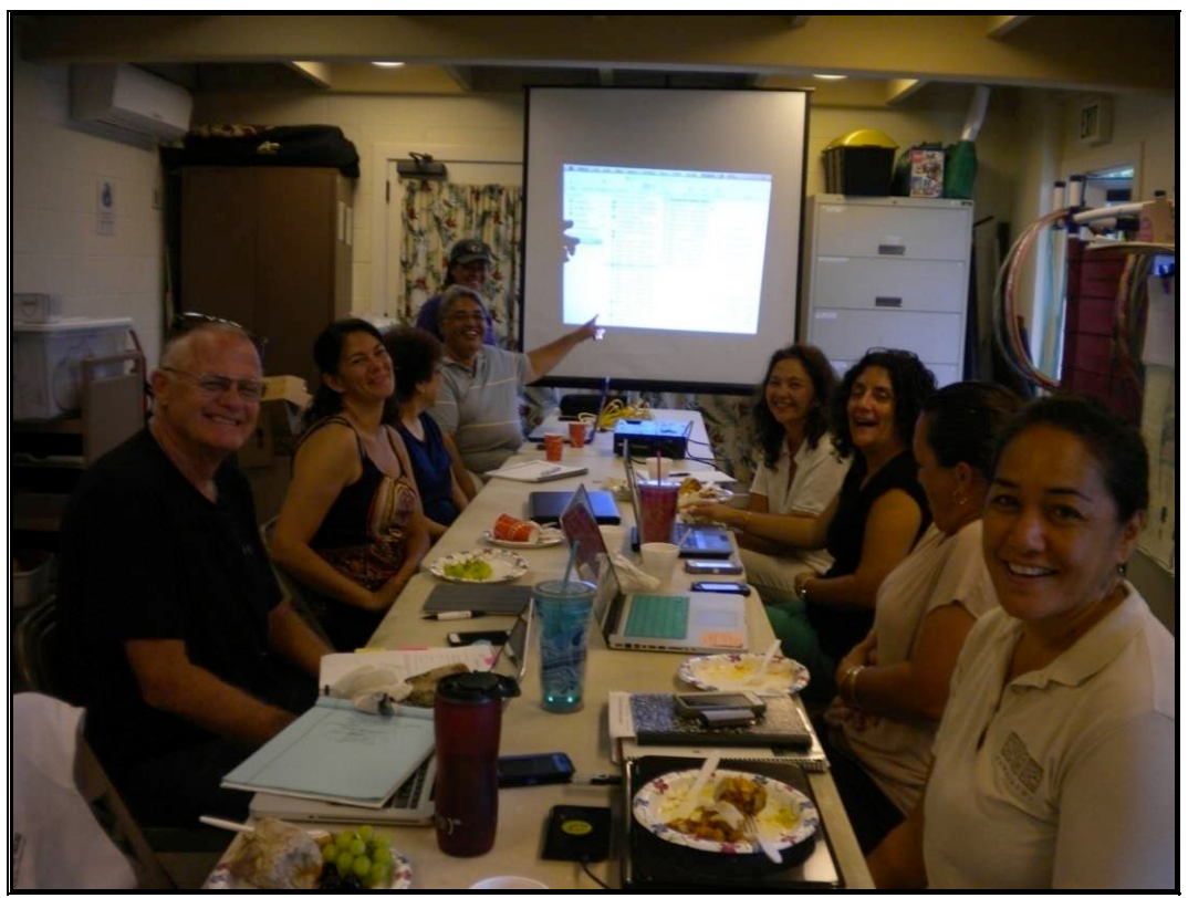
Accreditation Committee Chairs and Consultants meet to discuss their drafts

In June 2013 the administrators and steering committee teacher attended a full-day workshop with updated training and information related to completing the Self-Study and Action Plan. At the June 2013 Chairperson's meeting, each chair reported on the indicators, overall strengths, and areas for development for each chapter of the final Self-Study Report following guidelines for Appraising the Independent School, K-12. Discussion and prioritization of the areas of need based on their findings followed with orientation regarding development of the WASC Action Plan provided by the HAIS consultant assigned to assist us.