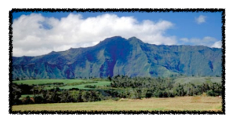
HAIS / WASC Accreditation Self-Study 2014 Ke Kula Hoʻāmana ʻo Kawaikini