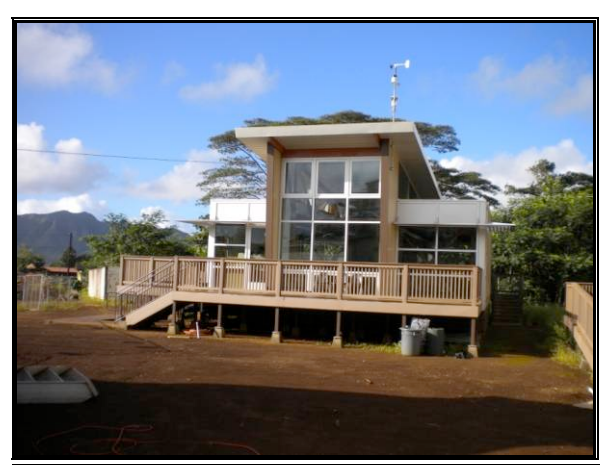
Project Frog Energy-Efficient "Smart" Buildings, aka "Hale Akamai"

Grounds of the school now include an enclosed playground area in the lower campus area, a garden for student projects, and a semi-enclosed grass field in the upper campus area. There are two roads leading to these areas, one of which serves as an emergency exit from campus, if necessary.