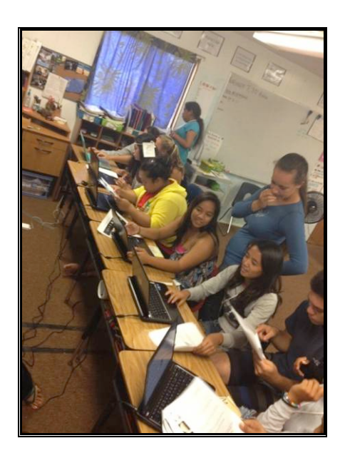
Students working online in classroom

Work continued throughout the 2012-2013 school year to identify specific desired student learning outcomes and provide a framework for educational standards necessary to reach those outcomes — in a context that reflects and honors Hawaiian knowledge, perspectives, and cultural practices shared by various stakeholders. Until 2013 Kawaikini's ESLRs were based on the Hawai'i State Standards. In 2012-2013 the school began to transition the alignment of the ESLRS to the new statewide Common Core Standards.