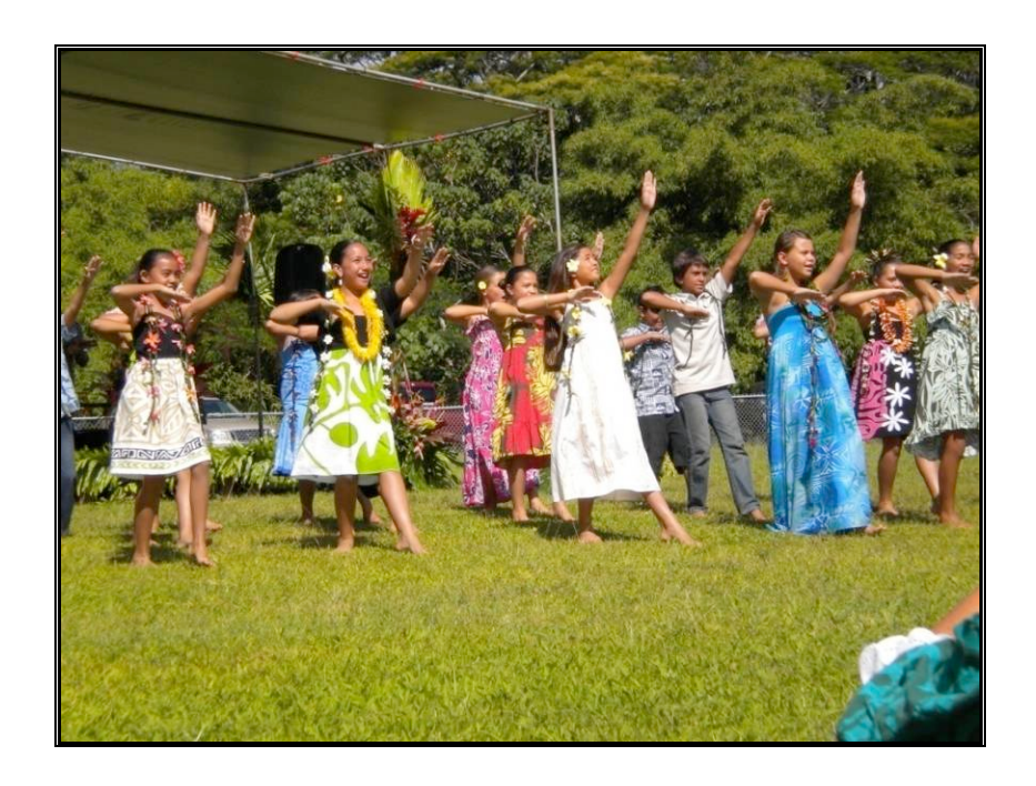
Students performing at Lā Ho'ike'ike schoolwide performance

Through the medium of the Hawaiian language, Kawaikini New Century Public Charter School will create a supportive learning environment where indigenous cultural knowledge is valued, applied, and perpetuated.